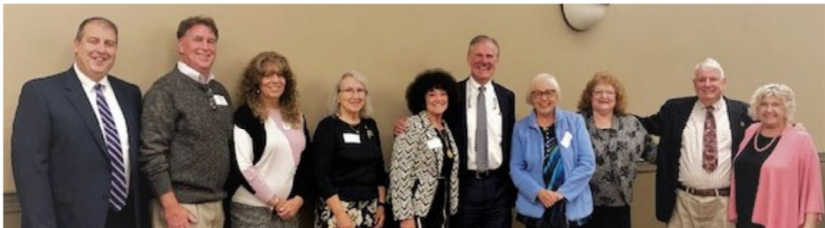
NCMAR REALTORS with 30+ years of membership